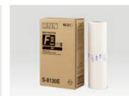
RISO MASTER FII Type (A3: 220 sheets)