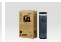
RISO INK FII Type Black (1000 ml)