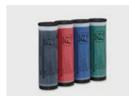
RISO INK FII Type Color (1000 ml)

The RISO iQuality mark indicates a RISO product compatible with the RISO iQuality System.