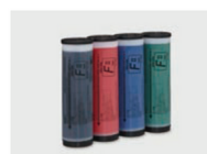
RISO INK FII Type Color (1000 ml)

The RISO iQuality mark indicates a RISO product compatible with the RISO iQuality System.