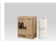
RISO MASTER FII Type (A4: 295 sheets)