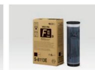
RISO INK FII Type Black (1000 ml)