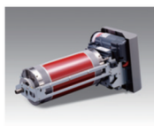
RISO CV Drum A4