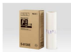
RISO MASTER FII Type (A3: 220 sheets)