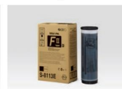
RISO INK FII Type Black (1000 ml)