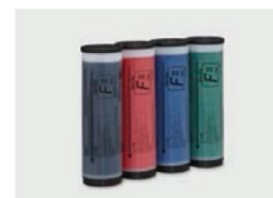
RISO INK FII Type Color (1000 ml)

The RISO i Quality mark indicates a RISO product compatible with the RISO i Quality System.